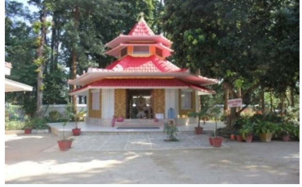
Fig 11: Sacred Grove situated at the Manora, Jashpur