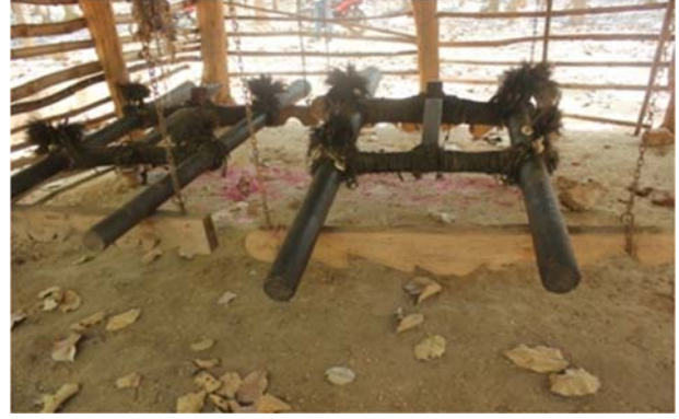
Fig 12: Aanga dev situated at Jagdalpur, Chhattisgarh