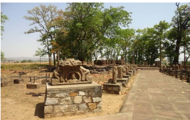
Fig 10: Sacred Grove at Ambikapur, Chhattisgarh