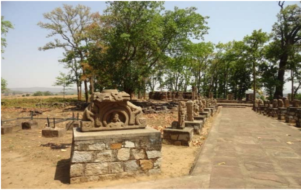
Fig 8: Sacred Grove at Ambikapur, Chhattisgarh