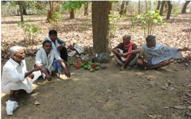
Fig 1: Aama Jogani Festival ceremony at Vishrampuri, Kondagaon, Chhattisgarh

conservation of many medicinal and endangered species. So, species component and bio-diversity is important factor in our sacred groves. But still in many places cutting of trees is going on in many places of our country and strict measures should be taken to stop this action. Because in this stage of global warming this is the best method of conserving forest and saving our environment.