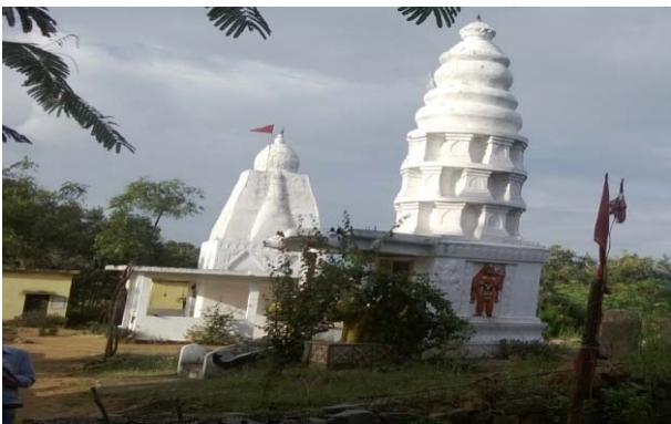
Fig 9: Shitala Mata temple at Pithora range, Chhattisgarh