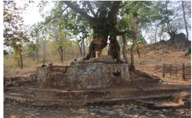
Fig 4: A statue of lion placed at sacred groves Durbhat area of Keshkal, Chhattisgarh

I pay my heart full thanks to PCCF & all Field Officer of State Forest Training Research Institute, Raipur for data and Literature collection during writing this article & also for their for guidance, moral support.