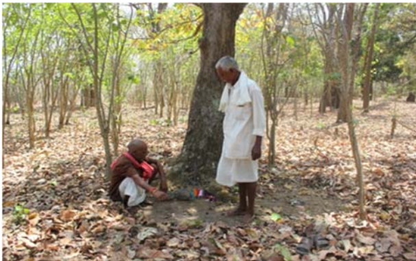
Fig 2: Aama Jogani Festival ceremony at Vishrampuri, Kondagaon, Chhattisgarh