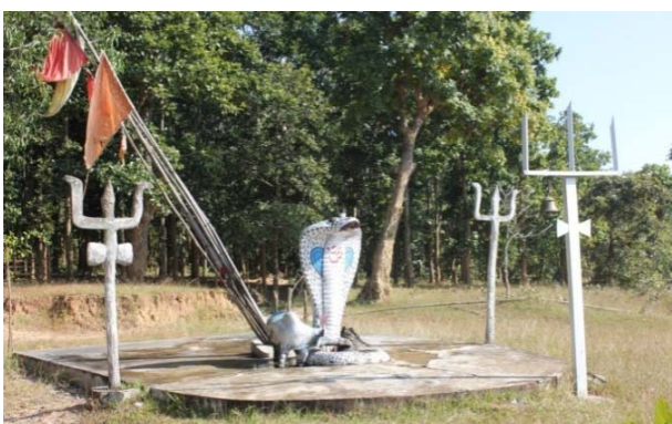
Fig 3: Harra deepa Sarna situated at Jashpur area of Chhattisgarh