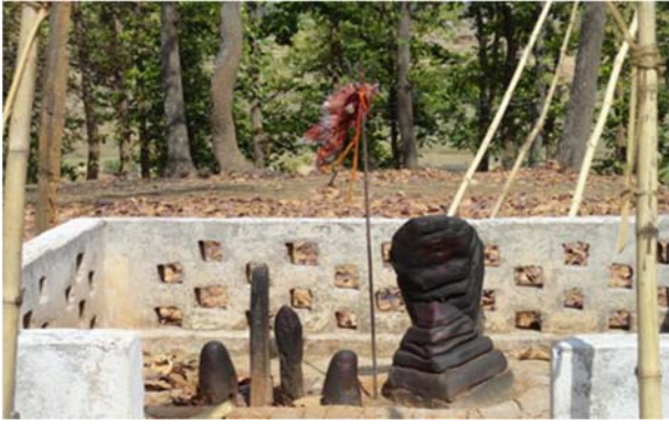
Fig 7: Sacred grove of East Ambikapur, Chhattisgarh